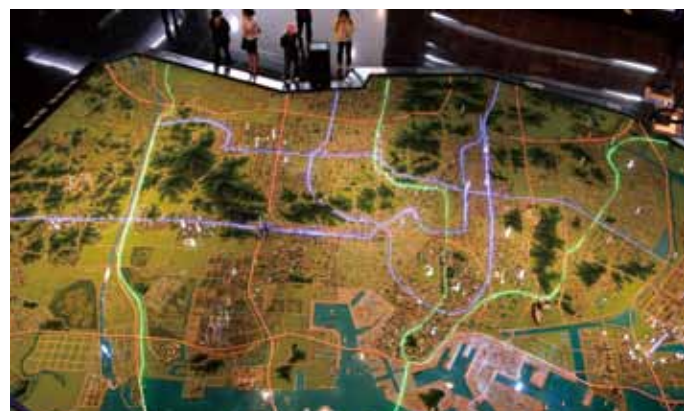
Compact Smart City

The Compact Smart City is an exhibition center where visitors can see in one view the history of Incheon and the process of constructing the Songdo International Business District. It is comprised of 4 ground floors and 1 basement level. The center presents the past, present, and future of Incheon in the Ancient and Modern Exhibition Hall, the Incheon Miniature Hall, the Experience Exhibition Hall, the 5D Theater, and the 4D Theater. While the Ancient and Modern Exhibition Hall on the 1st floor shows the birth of Incheon, the Incheon Miniature Hall on the 2nd floor presents a model of Incheon at a scale of 1:1,200. Visitors can also view the fast-growing Songdo through various 3D and 4D images. (☎ 032-850-6000)